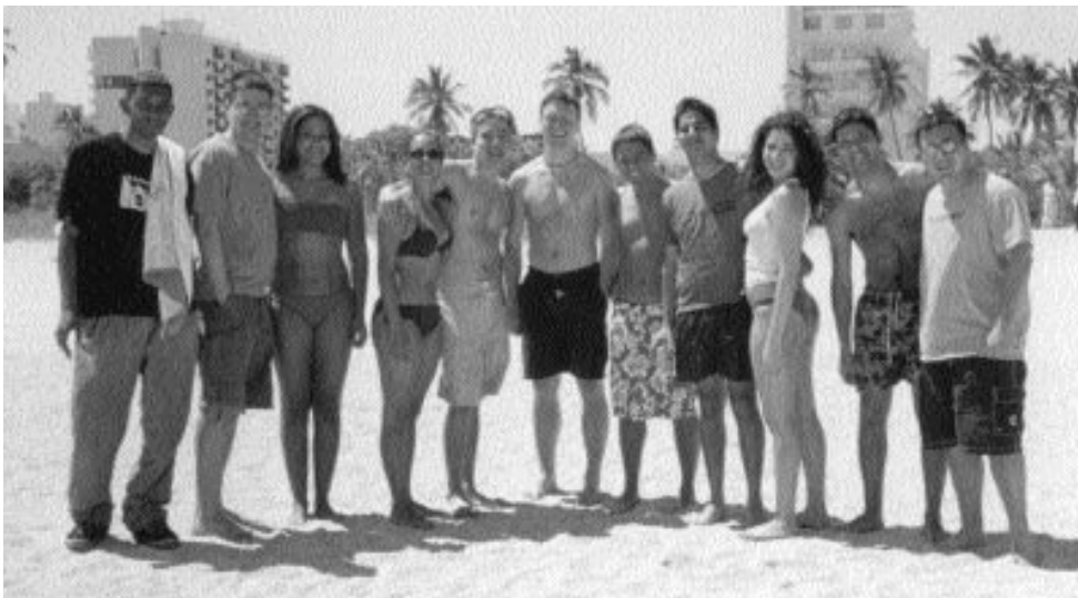
Brothers on spring break in Miami.