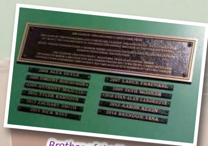
Brother of the Year Winners