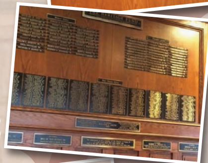
Updated Heritage Donors