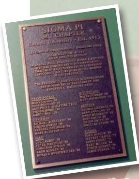
Brother of the Year Donor Plaque