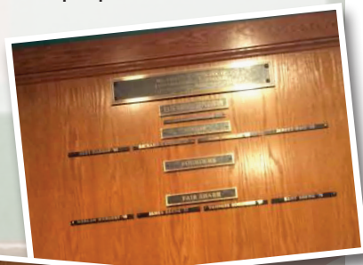
Educational Foundation Historic Donors

The photos and layouts below provide a good sense of the changes that have occurred. The best way, of course, to view these is to visit 730 University Avenue and see them yourself.