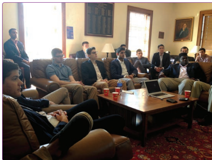
The brothers of Sigma Pi at the first annual Sigma Pi entrepreneurship conference on April 16, 2016.