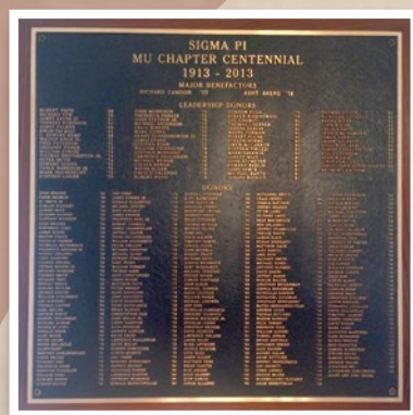
Centennial Plaque in the West Lounge