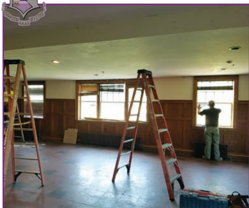
Construction on the Learning Commons at the chapter house began in June and will be completed in time for the fall semester.