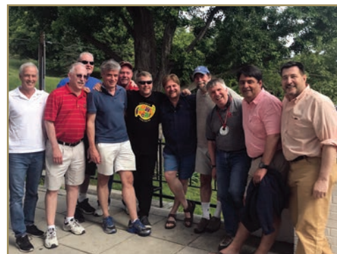
Alumni gather during reunion weekend and view the house renovation.