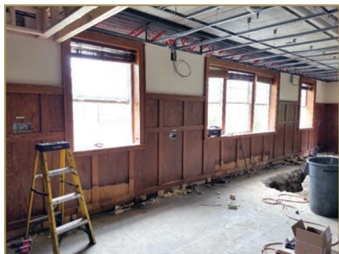
New Learning Commons Area.

Dining and Learning for the Next Generation