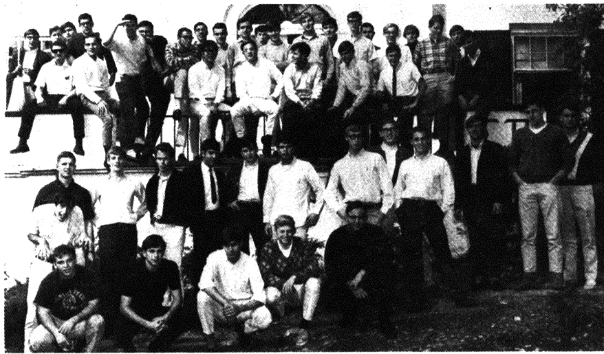
Here are the 1967 brothers. How many do you recognize?