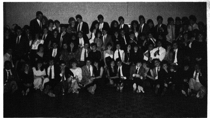
Orchid Ball 1988.