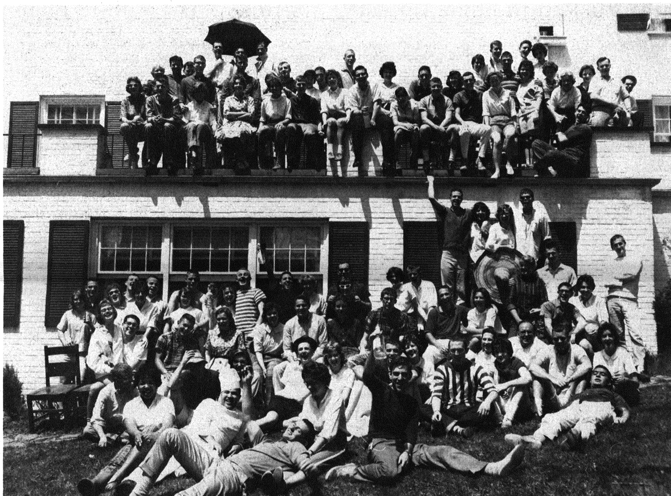
Sigma Pi, Spring Weekend 1961.