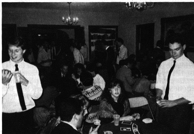
There was a full house for Casino Night at Saturday's formal during Homecoming.