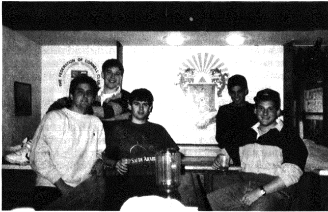
The brothers hang out at the bar, which was renovated by last year's pledges.