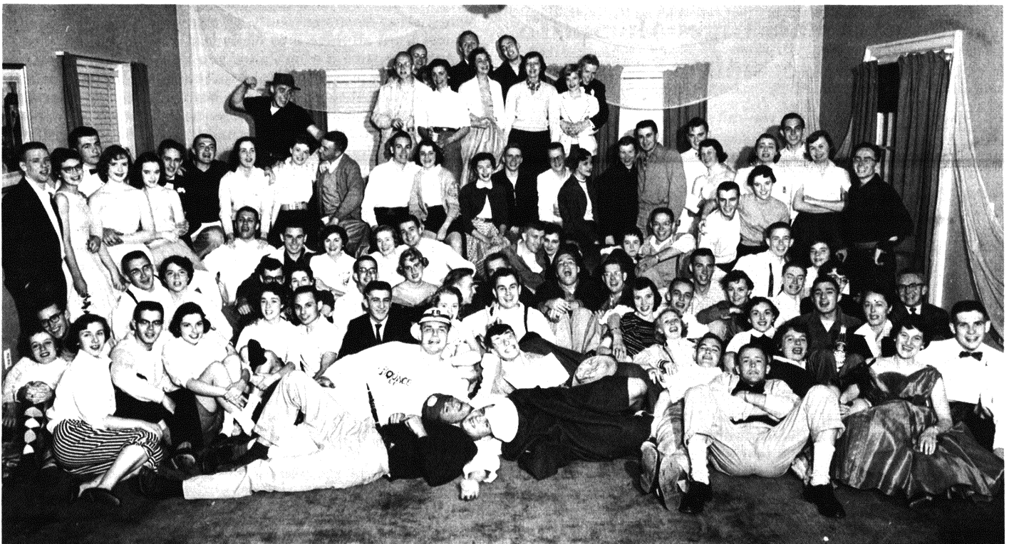
Sigma Pi's Spring Weekend, May 14, 1955.