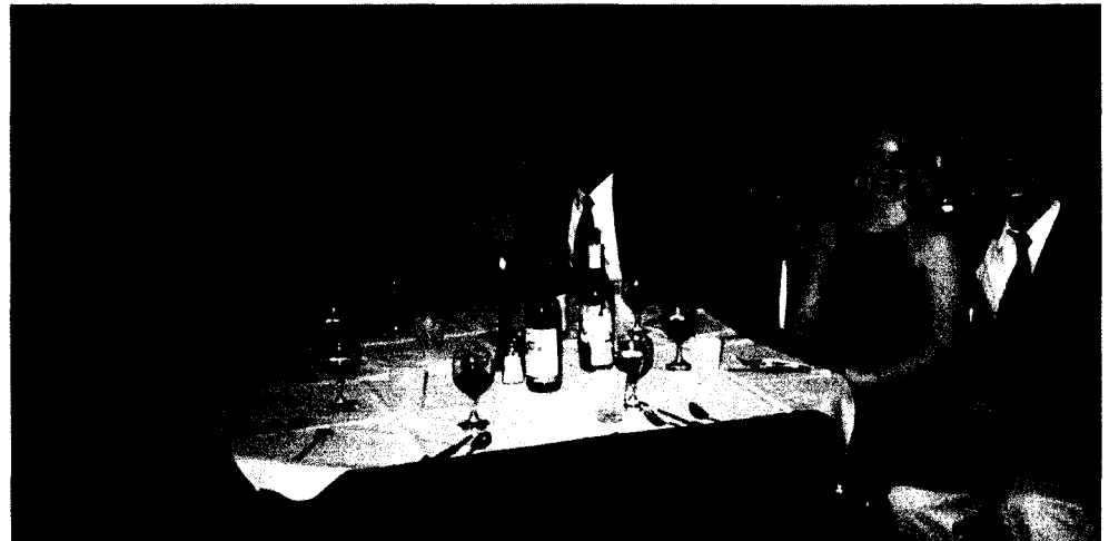
Brothers and their dates enjoying the Valentine's Day semiformal.

The continued success of this newsletter is due, in part, to the participation of our alumni. Please take a moment to fill out your newsform and return it to the address provided at the bottom of page three. Write and let us know what you've been up to before the next issue of The Muse .