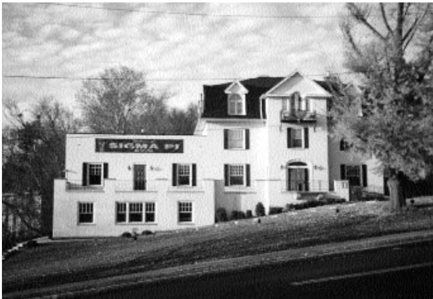
The Pi-house decked out to welcome Sigma Pi alums at Homecoming. For photos of this wonderful event, turn to pages four and five.