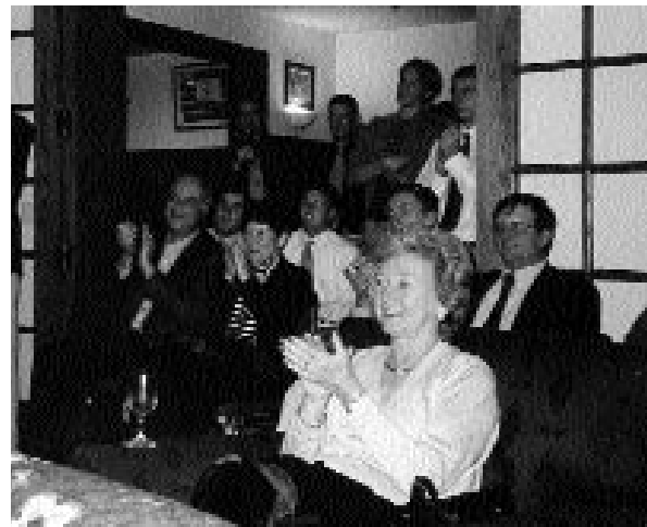
A round of applause for The Hangovers.