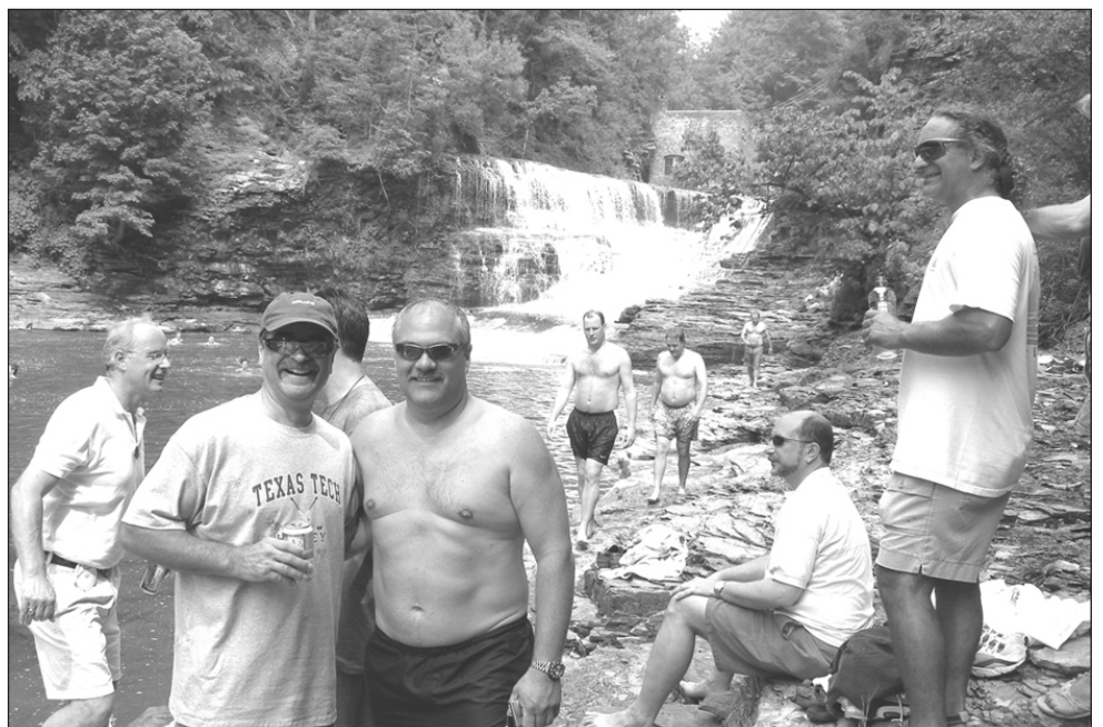
Members of the class of 1980 enjoy one of Ithaca's many gorges during reunion.