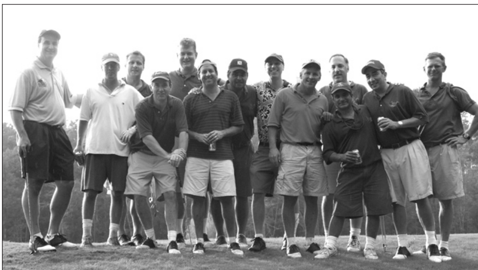
The Procrasticup 2005.