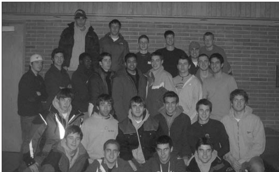
Members of Mu Chapter's pledge class pose for a photo.

Updated donor lists will be published in each new Muse or fund mailing.