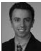
By Jacob Slowik '09 Sage

I address you as the current Sage, brimming with pride at the work our brotherhood has accomplished over the past semester.