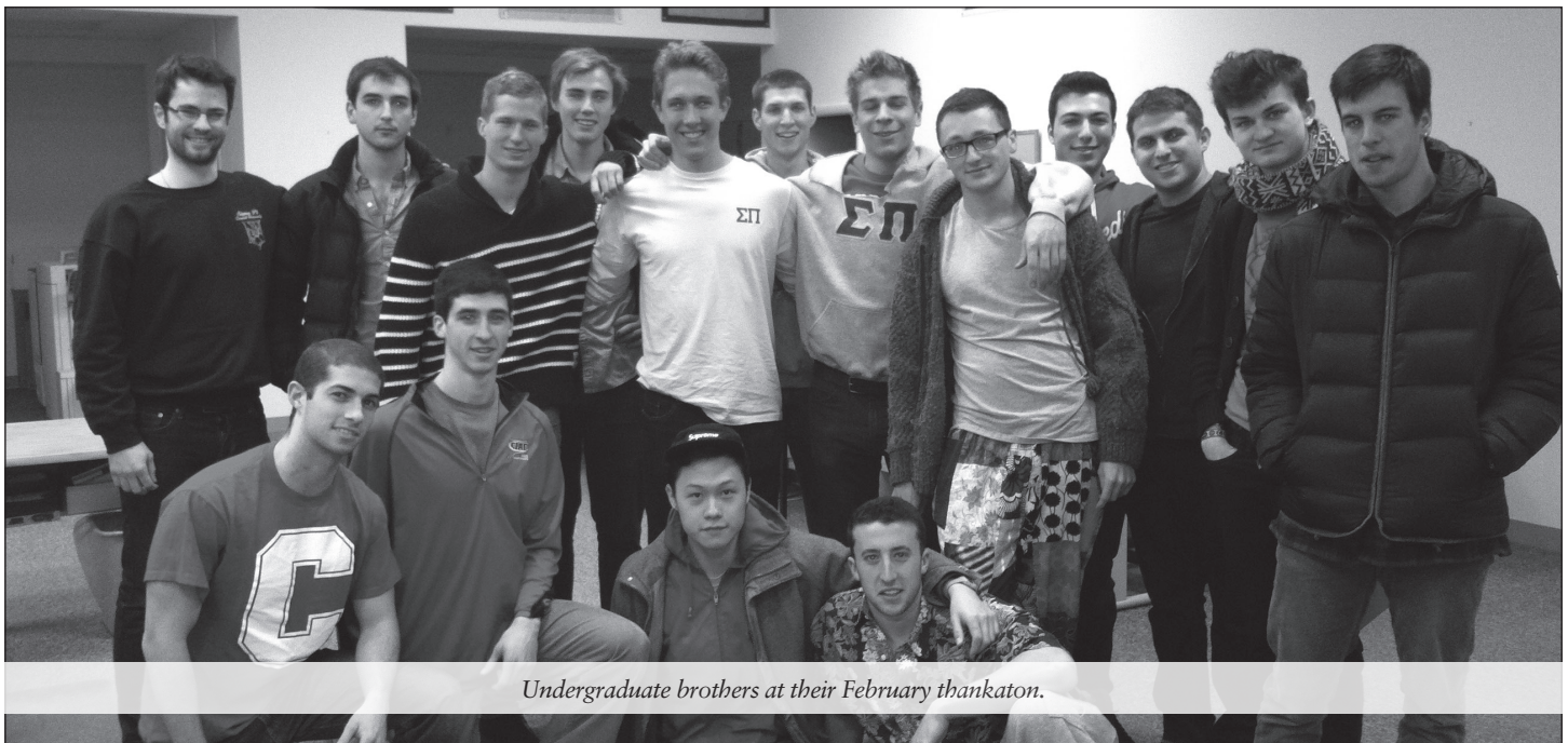
Undergraduate brothers at their February thankaton.