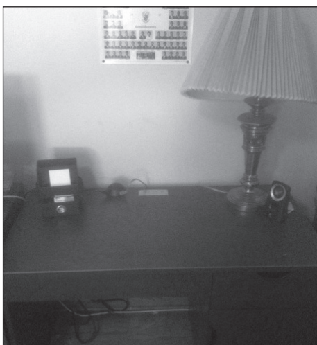
New desk installed in room 307, The Circle Inn.

academics, and this effort has shown positive results as the fraternity recently improved from 21st place to 15th in GPA rankings among fraternities. We hope the new desks will further encourage and build upon this trend.