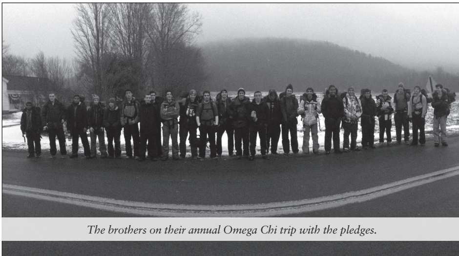
The brothers on their annual Omega Chi trip with the pledges.