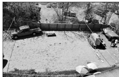
Parking lot becomes a beach.