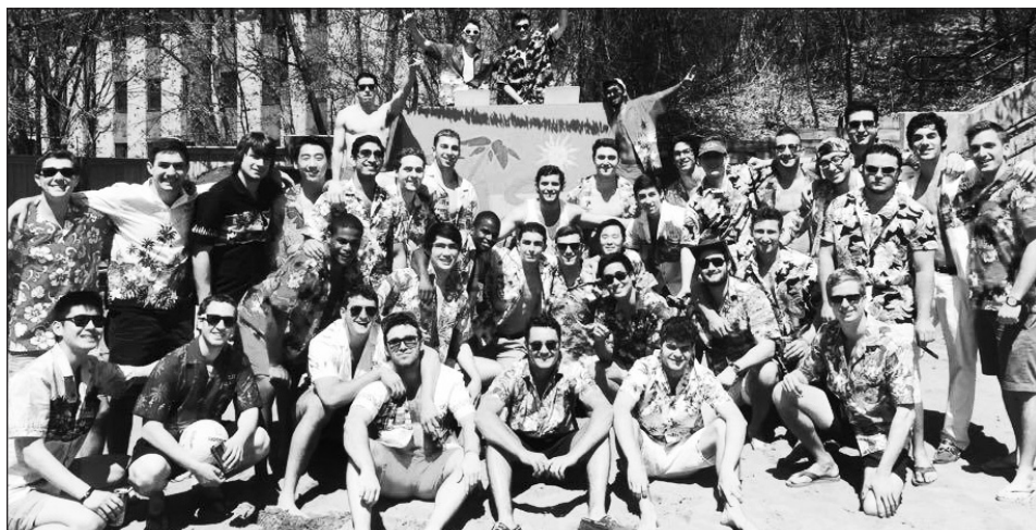
2015 beach party.

Lastly, I'd like to touch on Mu Chapter's greatest strength: its bonds of brotherhood. There's nothing we appreciate more than having alumni visit and seeing the bonds that have been created stretch across generations of Pi men. I encourage you to keep up with us on the website or come visit in person, and I genuinely thank you for all the support you provide.