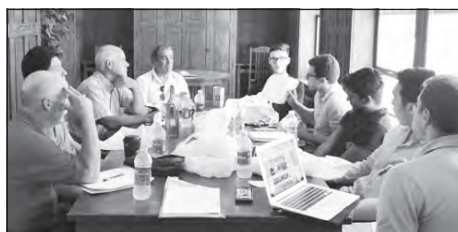
Career and Mentoring Committee Members and Volunteers

Looking forward, the program will continue to take advantage of the Tech Center, allowing for easier and more frequent alumni/undergraduate communications that promote even more meaningful relationships between undergraduates and alumni, including potential career "days," specialized workshops, and other events to link alumni and undergraduates.