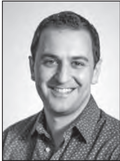
John Zimmer '06

John Zimmer '06 is the president of Lyft, Inc., an on-demand transportation company, which he founded with Logan Green in 2012. Lyft had its initial public offering (IPO) of stock on March 29. Andrew Ross Sorkin '99 , co-anchor of CNBC's Squawk Box , interviewed John and his colleague Lyft co-founder, Logan Green, on the occasion. During the interview, Andrew mentioned Cornell and Sigma Pi during an exchange with in-studio co-host Joe Kernen: