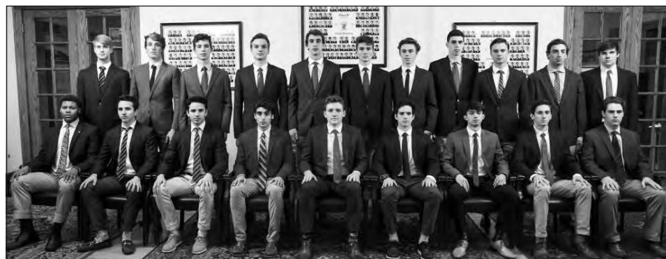
Spring 2019 pledge class.