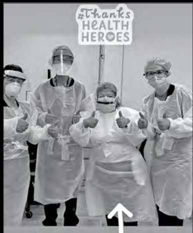
Mom and her crew @ Elmhurst Hospital, Queens 🙌🙌