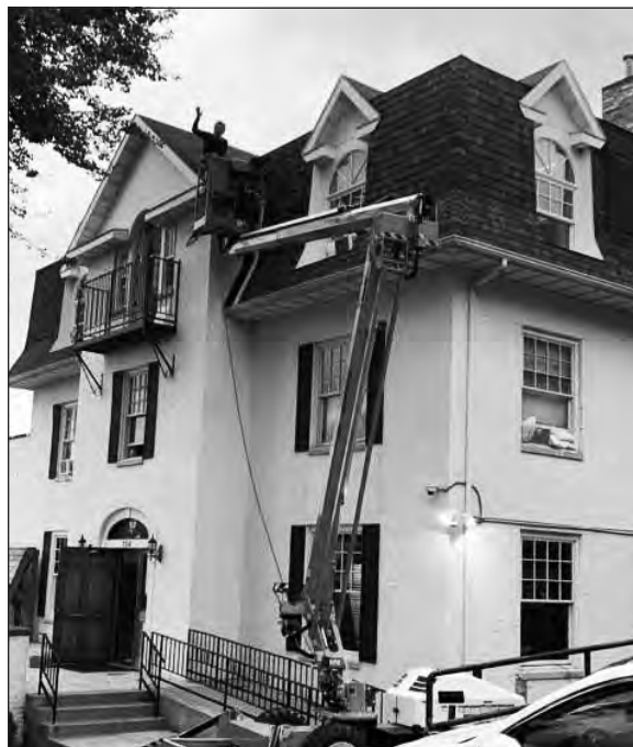
Liviu Rusu '98 on the crane that made it possible to comply with COVID restrictions of working alone.

The roof replacement project is nearly complete. We've had some surprises and