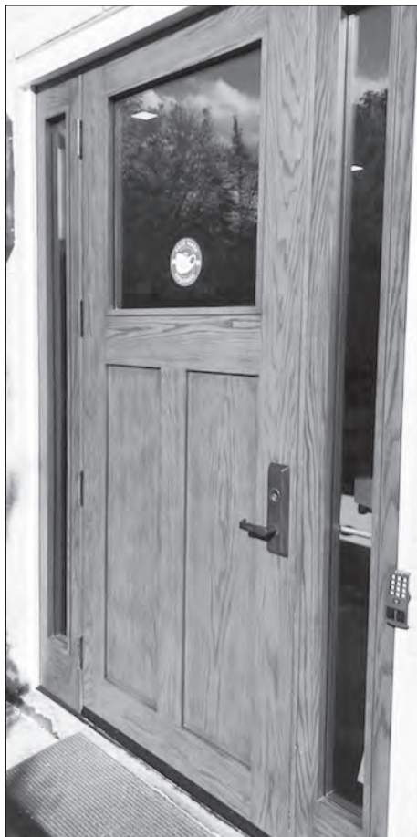
Installation of New Kitchen Door

I will work with our attorney and our contractors' representatives to complete all the remaining contractual obligations. The final payment will be made as soon as all of the outstanding items are settled.