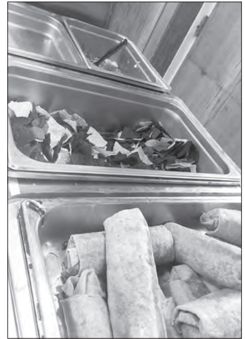
New meal service.