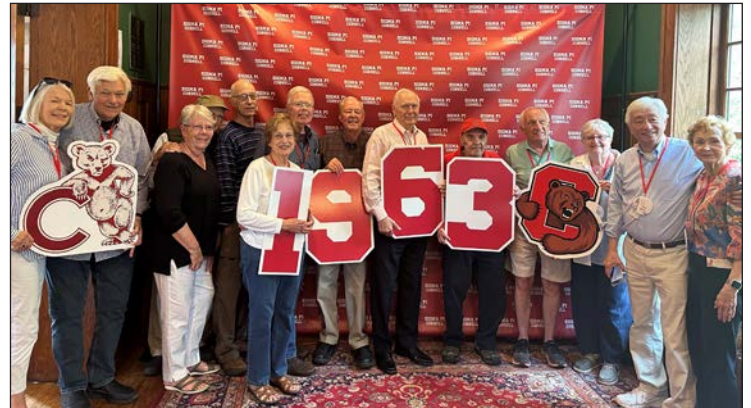
Class of 1963 celebrates 60 th reunion