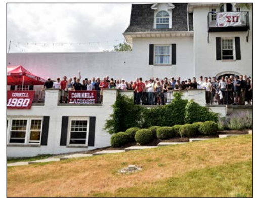
Reunion 2023 at the Sigma Pi house.