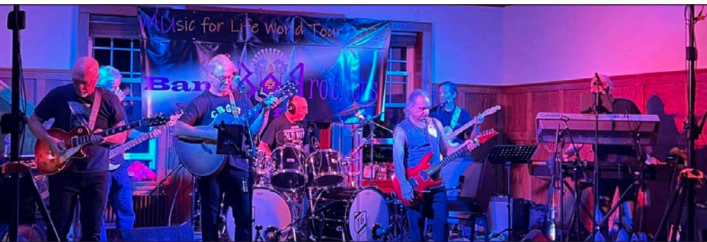
Band of Brothers performing at Reunion 2023.