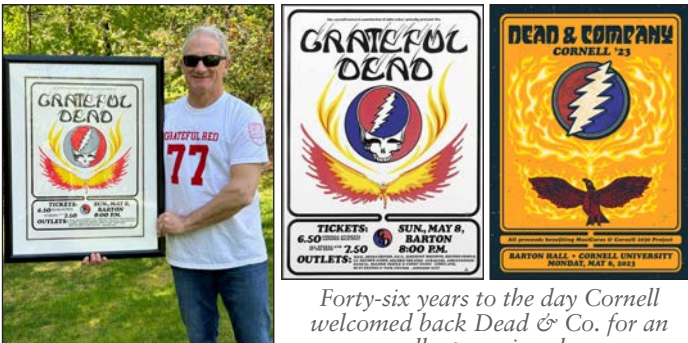
Forty-six years to the day Cornell welcomed back Dead & Co. for an excellent reunion show.

Alumni celebrate the Dead & Company return to Barton Hall on May 8 with commutative Grateful Red T-shirts as a fundraiser for CityLAX. The shirt highlights the year of the most famous Grateful Dead show of all time, on May 8, 1977, and the success and tradition of Big Red lacrosse!