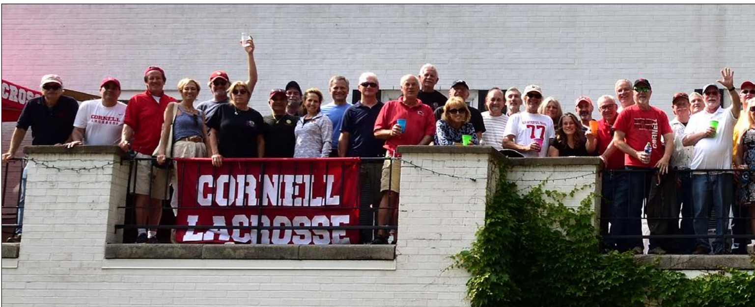
Reunion 2023 at the Sigma Pi house.