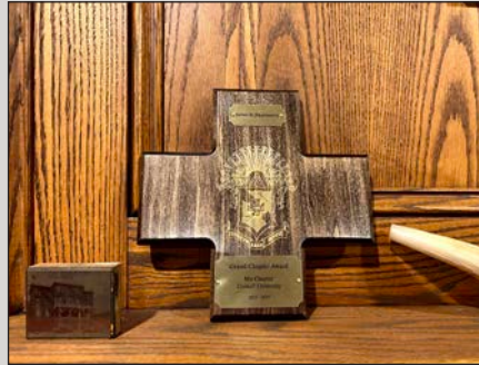
The Grand Chapter Award on display in the East Lounge at 730 University Avenue.