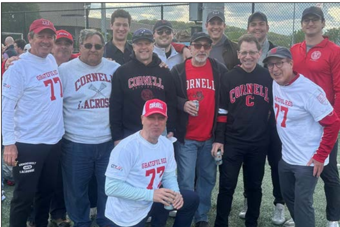
Alumni at the Ivy League Lacrosse Championship Game.