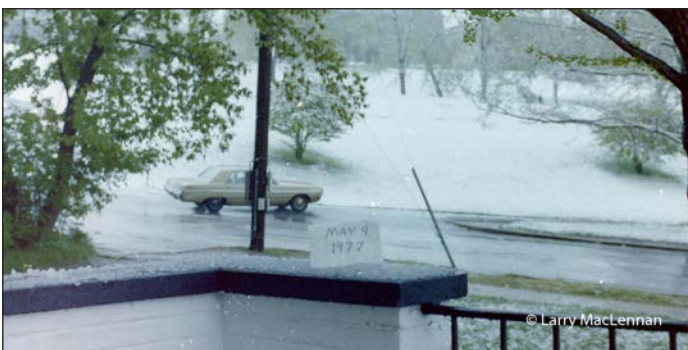
the day after the May 1977 show. All the Dead Heads freaked out when it started snowing at the conclusion of the concert!